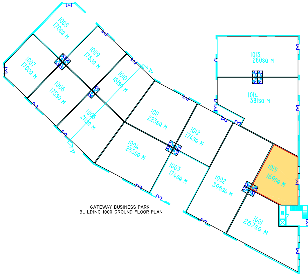
GATEWAY BUSINESS PARK BUILDING 1000 GROUND FLOOR PLAN